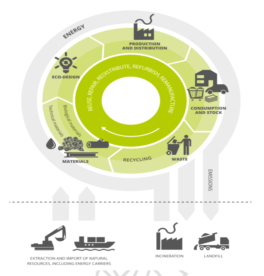
Figure 14.1: Circular Economy

However, where residual waste is generated, it should be dealt with in a way that follows the waste hierarchy (refer to Figure 14.2 ) and actively contributes to the economic, social and environmental goals of sustainable development.